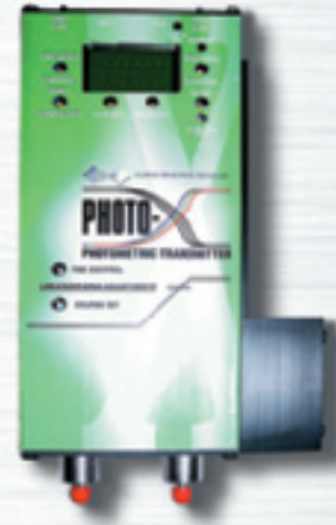
Model 55TL Turbidity Transmitter

Custom Sensors & Technology manufactures a low cost Photometric transmitter that produces a 4-20mA signal proportional to the amount of Turbidity in process streams. The transmitter is also supplied with an automatic manual/remote means of verifying the response of the transmitter. The transmitter can be supplied in either a logarithmic or linear mode of operation. CST can package for either GP, or Ex-Proof areas.