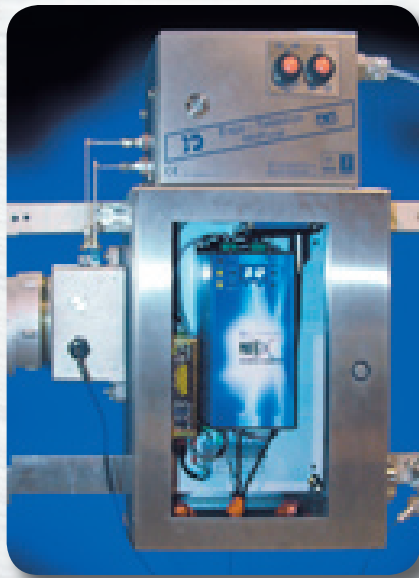
Ex-Proof Fiber Optic based UV Photo-X Fluorescence transmitter

Refined products that are transported in a single pipeline must be segregated into their respective tanks at the terminal station. Physical characteristics of the fuels such as density, API, and color, due to reformulation strategies have made different fuels indistinguishable from one another. Custom Sensors and Technology has developed a unique approach that allows precise fuel interface detection based on fluorescence of a dye that is injected at the refinery prior to transport to the terminal station. Once the dye plug is detected by the fluorometer, appropriate measures can be taken to properly route fuels into their respective storage tanks.