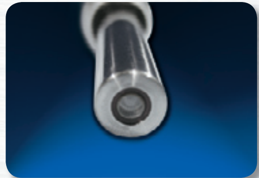
Front Surface Fluorescence Probe*

CS&T offers a uniquely designed fluorescence *probe that is unaffected by the traditional constraints of a transmission or 90° scatter flow cell or probe design. The ability to overcome the inner-filter effect can significantly improve your ability to measure and control the interface between different refined fuel products.