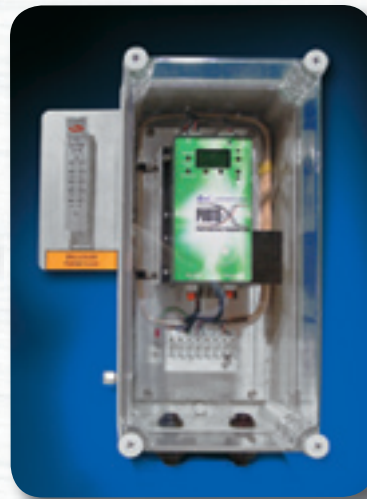
Model 55T Color Transmitter

Custom Sensors & Technology manufactures a low cost Photometric Transmitter that optically measures (via a remote fiber optic flow cells or probes) the amount of visible color in your process stream and sends a proportional 4-20mA signal to the control room.