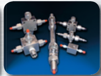
Extractive Flow Cells